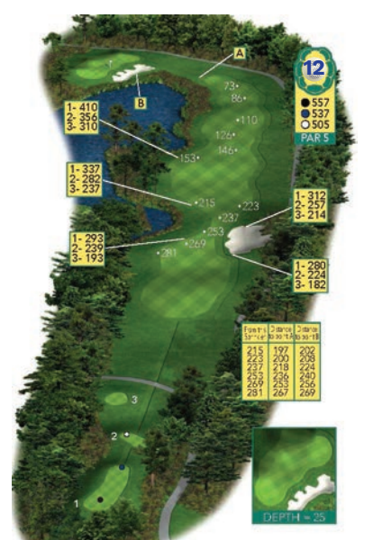
Hole 12 Par: 5

Arguably the most difficult par 5 on the entire course, this hole typically plays into the wind and is only reachable in two for the very longest of hitters. The tee shot has water that can come into play on the left and a fairway bunker guarding the right side. The second shot is all about risk and reward, and the more you bring the water on the left into play the shorter the shot you will have into the green. The green is protected by a large bunker in the front. Hit your approach shot too long and you risk releasing into one of the slippery catch areas behind the green. The back right hole location brings water and the front bunker into play. A conservative approach to the middle of the green will leave you with a tricky putt.