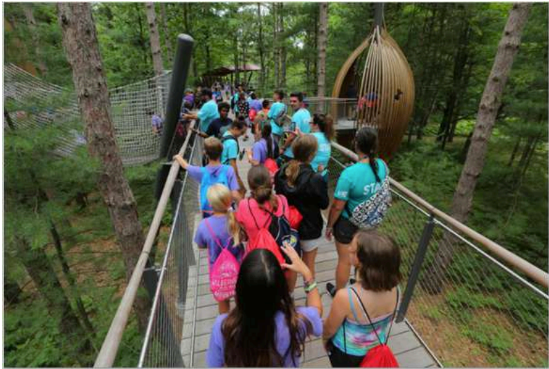
A 'canopy walk' through nature areas surrounding the venue, allowed 1,000 local kids to experience nature first-hand and learn about the value of protecting the environment.